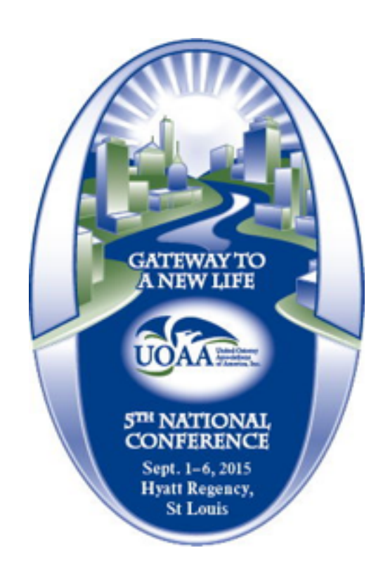
Sept 1-6, 2015 ● Fifth UOAA National Conference ● St Louis MO